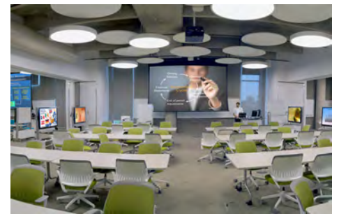
INTEGRATED TRAINING ROOMS