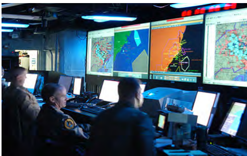
COMMAND & CONTROL