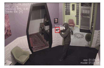
GUN DETECTION SOLUTION-BEFORE THE FIRST SHOT