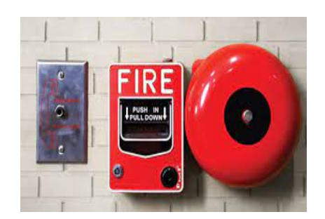
FIRE ALARM AND SAFETY