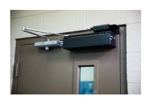
DOOR LOCKDOWN SECURITY